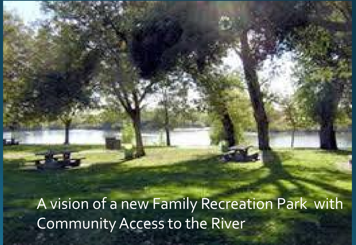
A vision of a new Family Recreation Park with Community Access to the River