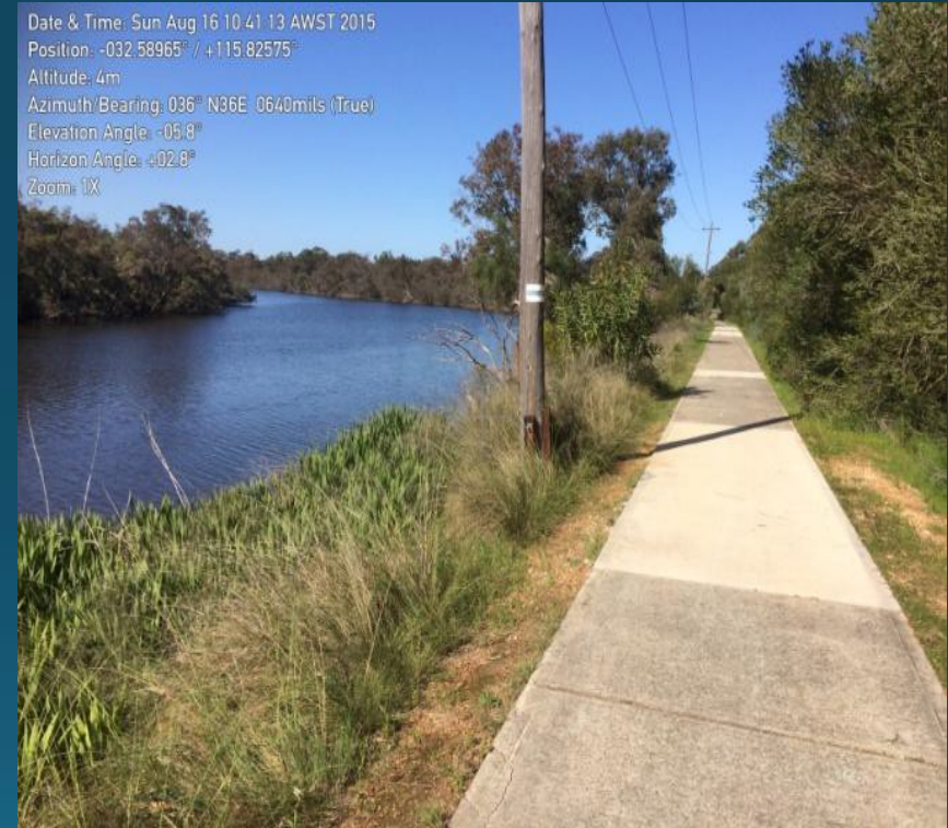
View of western power pole from cycle walking track. 1m to open face with a fall of 4m with no safety guarding