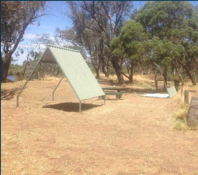
Frank Cross Park