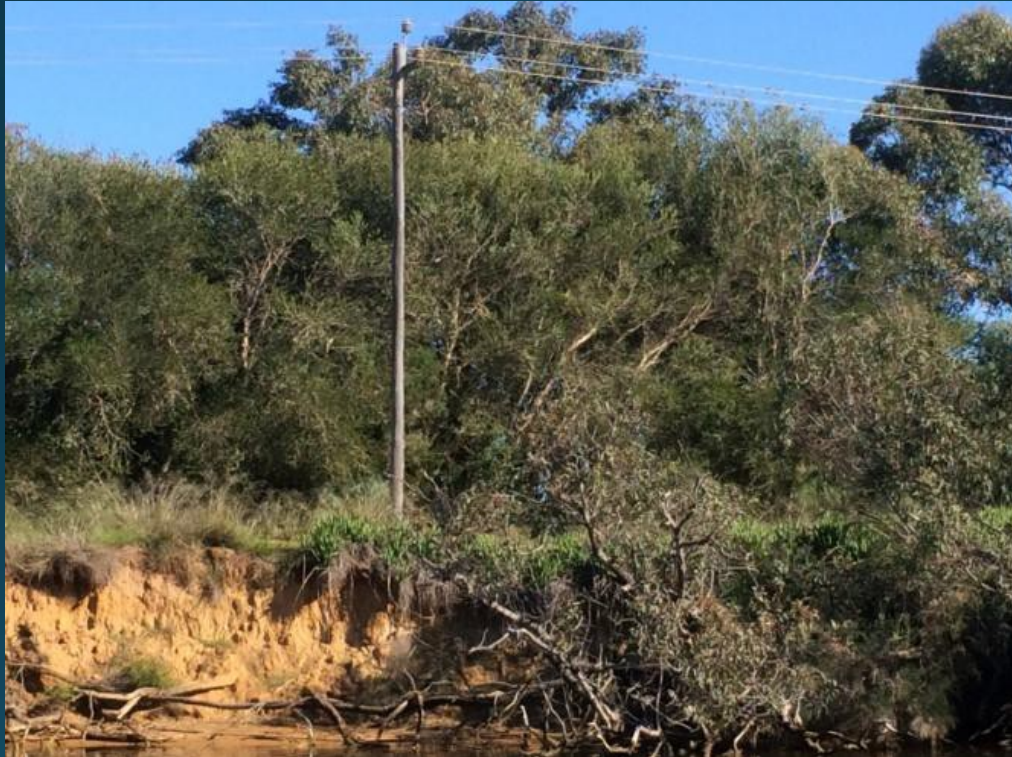
Undermining of western Power pole due to river bank erosion